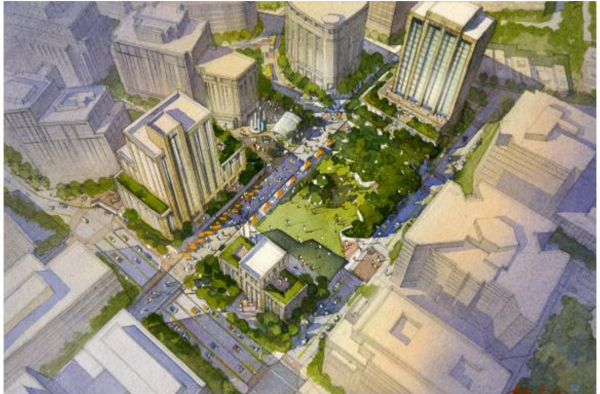
Figure 2.2: Conceptual birds-eye view looking northwest into Courthouse Square