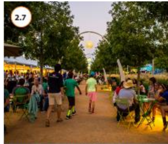
Figure 2.14: Example of a promenade adjacent to a central gathering place

A Courthouse Square Promenade will be a key pedestrian connection between Wilson Boulevard and 14th Street in the North Uhle Street right of way.