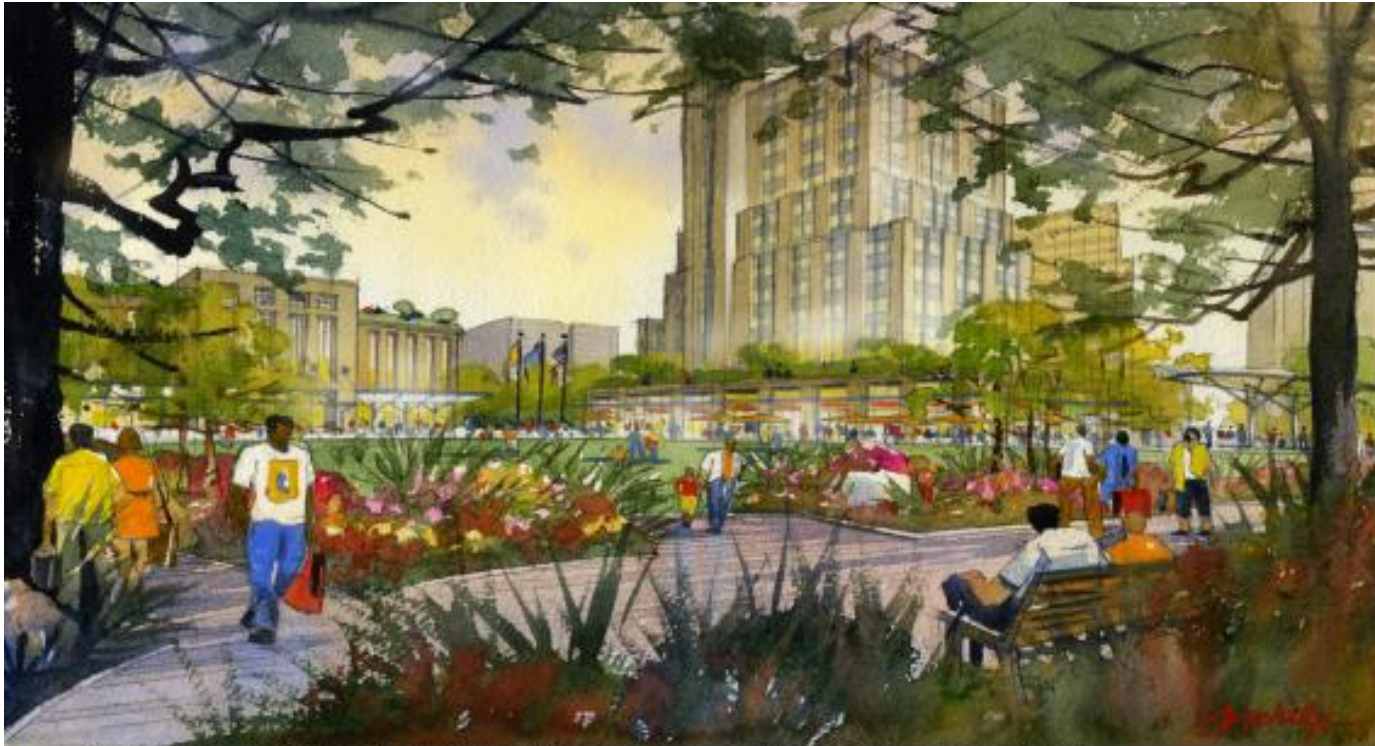
Figure 2.4: Conceptual view looking southwest into Courthouse Square from the Memorial Grove

Learn more at: Envision Courthouse Square - Projects & Planning (arlingtonva.us)