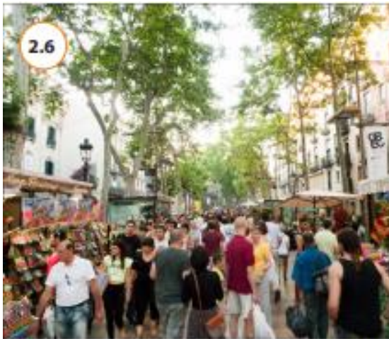
Figure 2.13: Pedestrian promenade with programmed events and shade trees