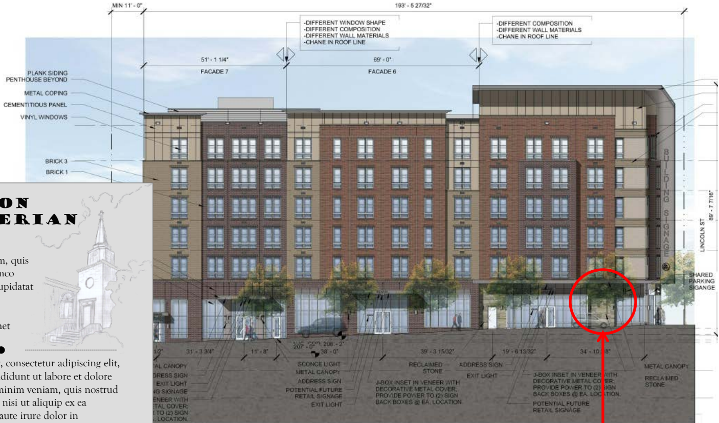
1 SOUTH ELEVATION - COLUMBIA PIKE A301 SCALE: 1/16" = 1'-0"

THIS SIGN ERECTED 2019 BY THE ARLINGTON PARTNERSHIP FOR AFFORDABLE HOUSING