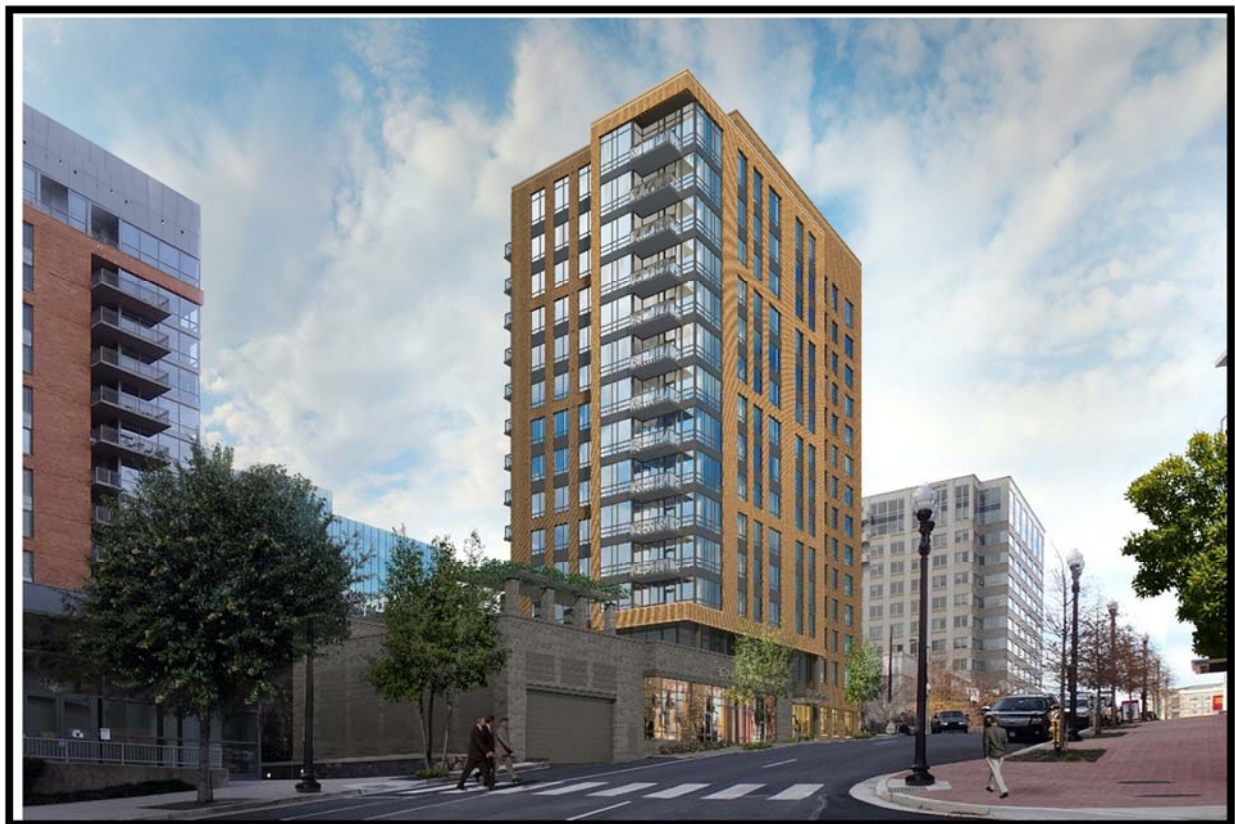
Figure 2—Clarendon Boulevard elevation