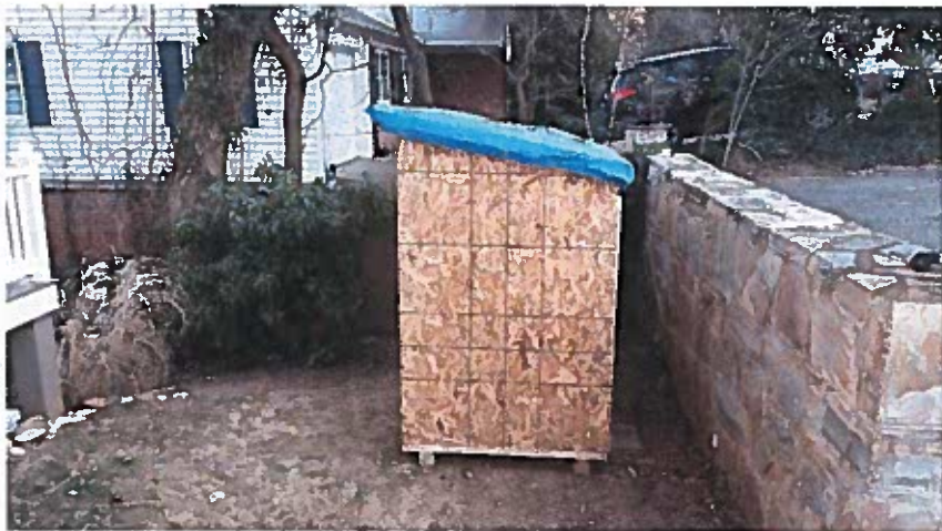
Current side view

Install a concrete block footer to level site.