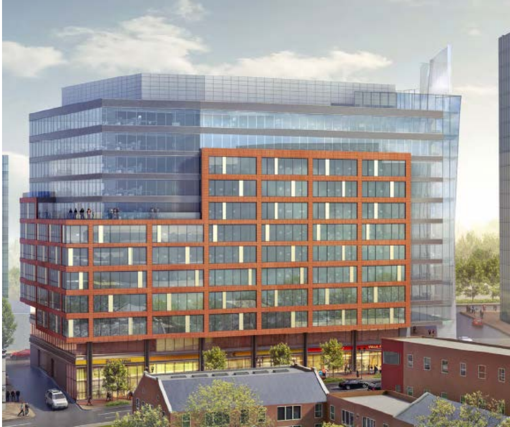
Revised architectural treatment (Wilson Blvd.)

LEED: The applicant proposes LEED Gold and Energy Star certification, and is requesting a modification of use regulations for a .45 FAR of bonus density.