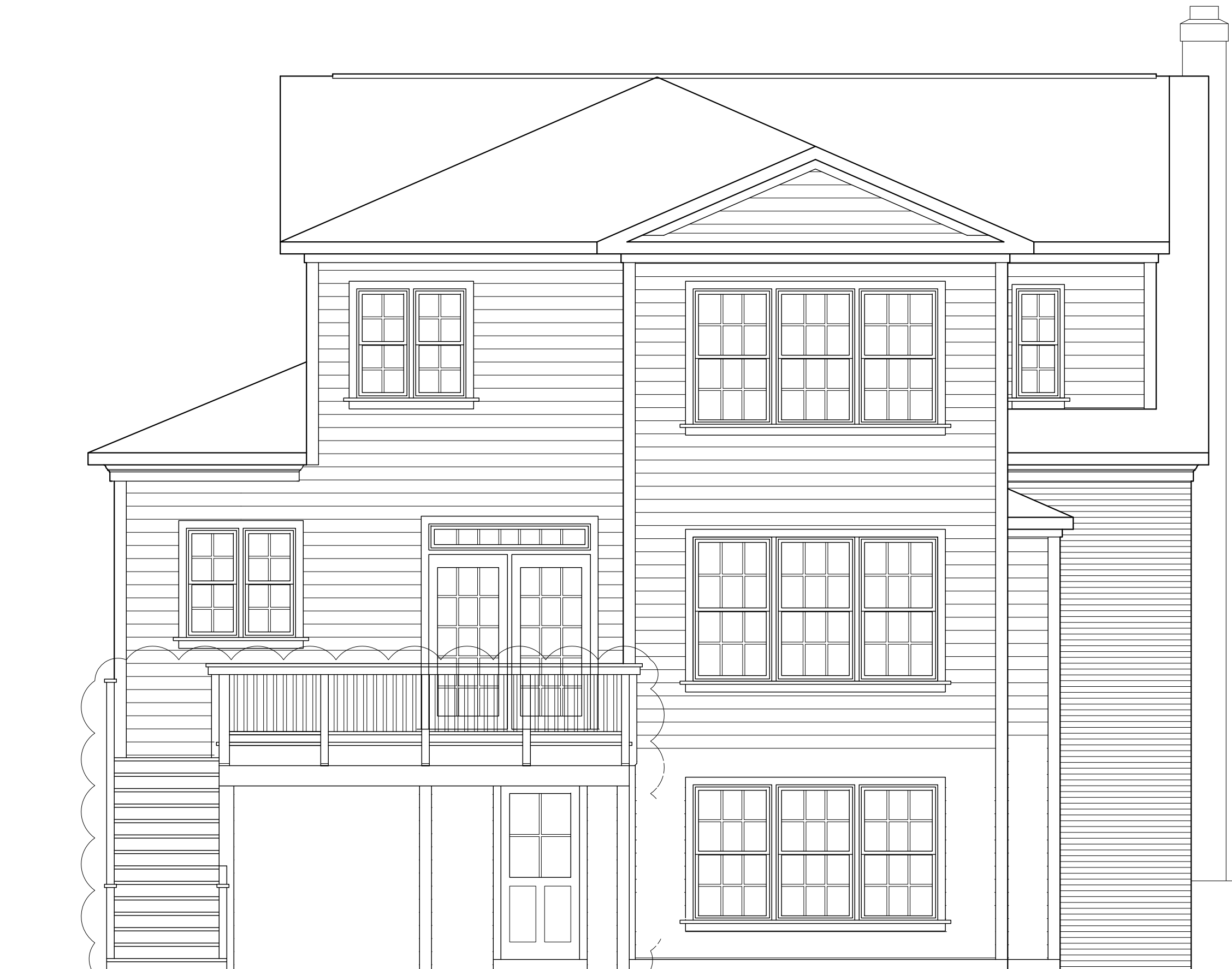
R E A R E L E V A T I O N