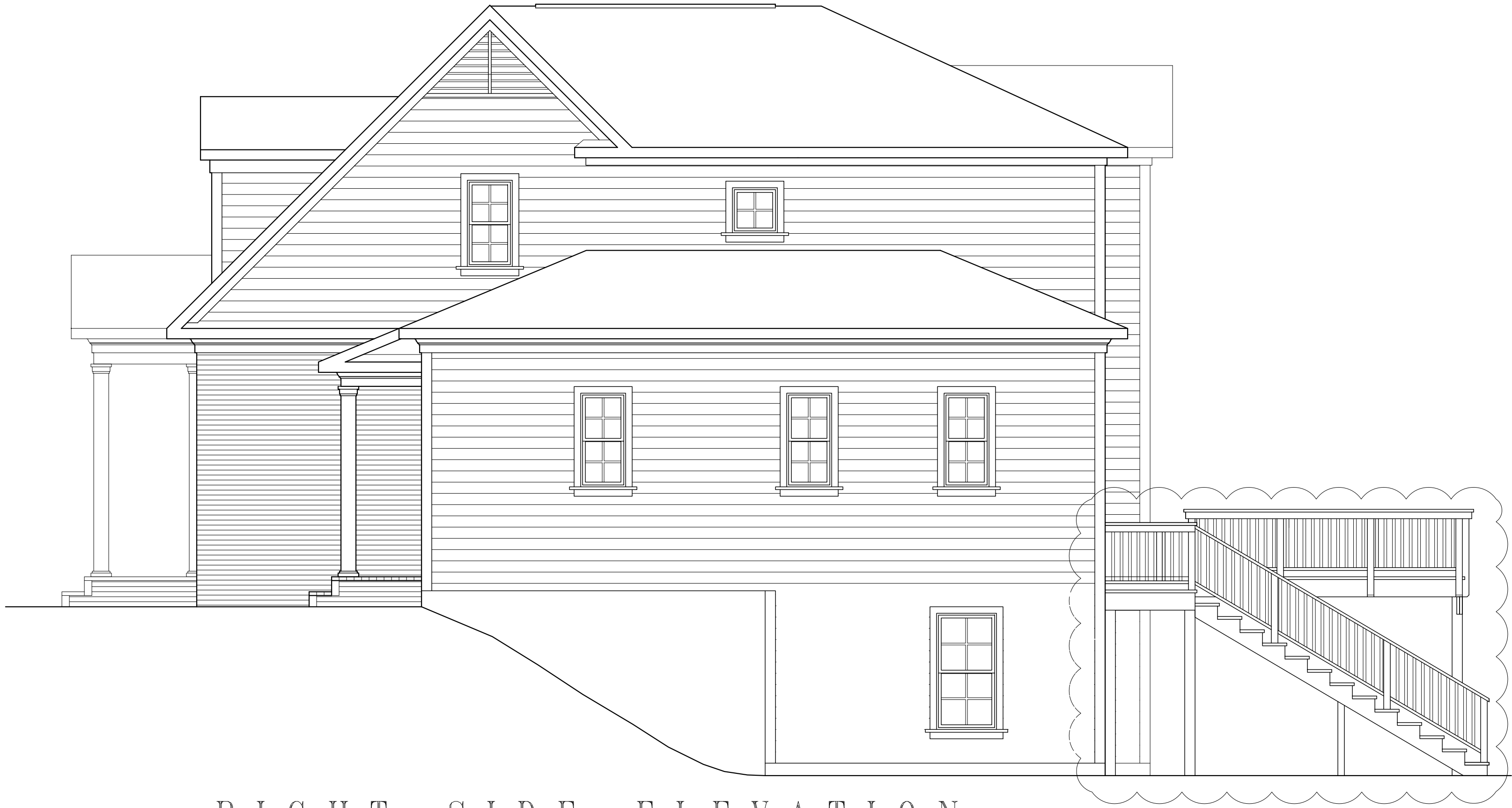
R I G H T S I D E E L E V A T I O N