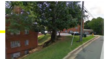
QUINN STR LOOKING EAST 34' DROP