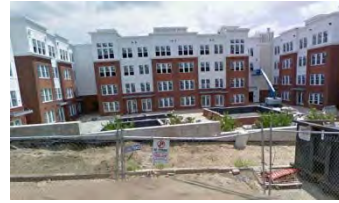
ROLFE STR COURTYARD NO MID-BLOCK PATH PROVIDED