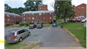
QUINN STR LOOKING WEST 34' DROP