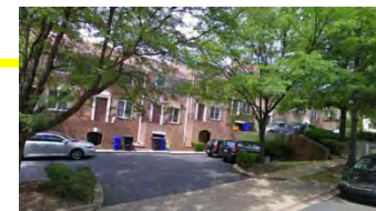
QUINN STR LOOKING WEST PATH BLOCKED BY PRIVATE TOWNHOUSES