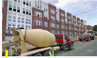
RHODES STR NO MID-BLOCK PATH PROVIDED