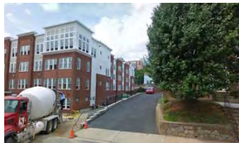
RHODES STR LOOKING WEST NO PATH PROVIDED, 16' DROP, GARAGE ENTRANCE TO NORTH BUILDING