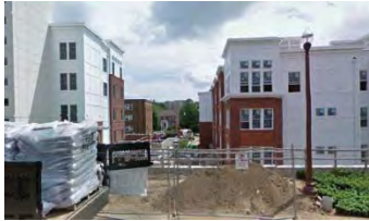
ROLFE STR LOOKING EAST 16' DROP , GARAGE ENTRANCE TO NORTH BUILDING