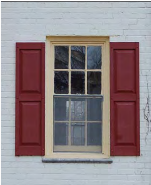
Above: examples of appropriate shutters