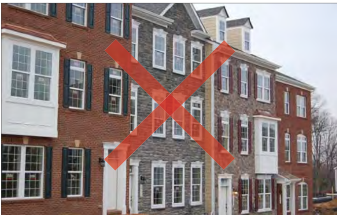
Example of inappropriate facade expression

(v) Contemporary or modern roofing systems including metal (other than as traditionally applied at porches or cupolas), wood shingles and clay or concrete tiles.