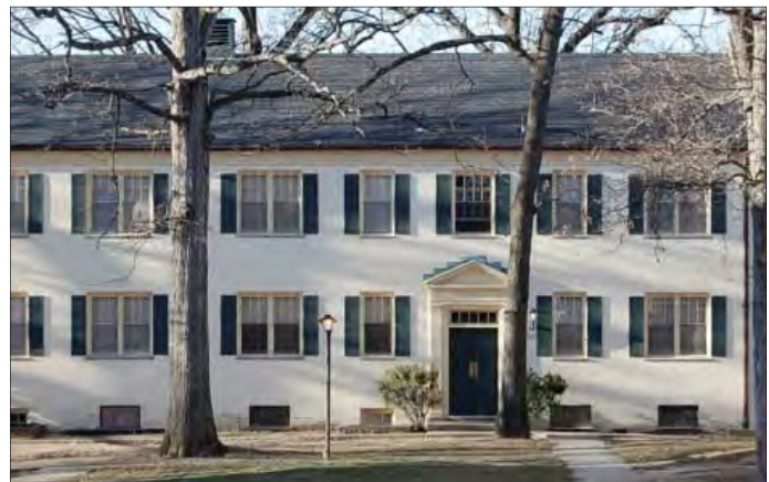
Example of appropriate facade expression

Photos are for illustrative purposes only, with no regulatory effect. They are provided as examples, and shall not imply that every element in the image is permitted.