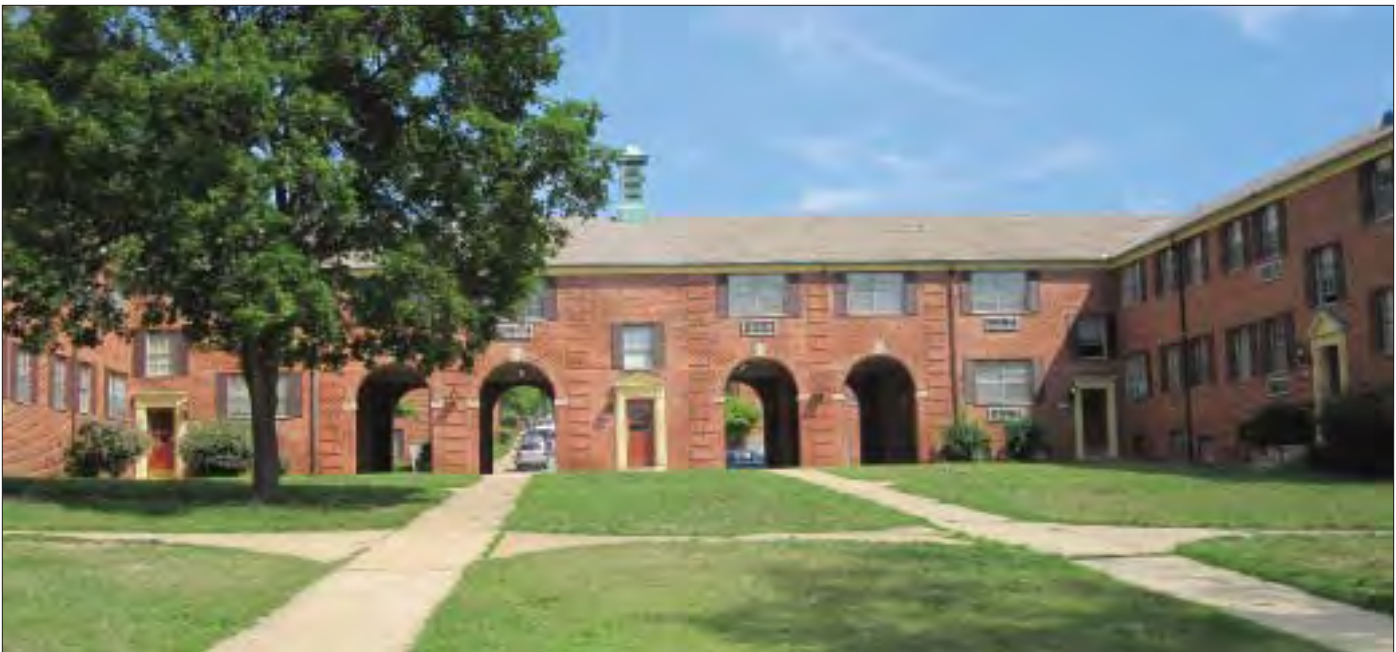
existing courtyard space at Barcroft Apartments

New buildings should be “contemporary” (i.e. “of the present time”), should display a style and construction methods that are of the period in which they are built and not become literal reproduction of an historic