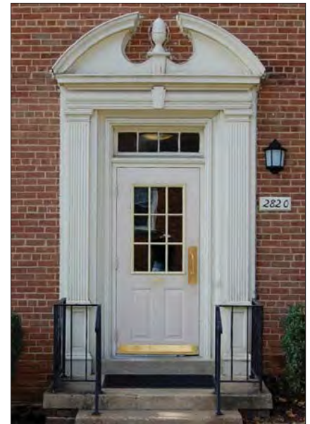
Right: examples of appropriate entrances and doors