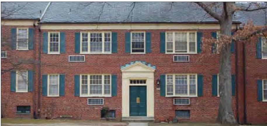
examples of appropriate roofing and windows

Photos are for illustrative purposes only, with no regulatory effect. They are provided as examples, and shall not imply that every element in the image is permitted.