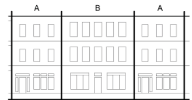
b. Illustrative intent

Front Porch. A single ground floor platform or two to three platforms stacked at the ground and upper STORY levels, and attached to a FACADE.