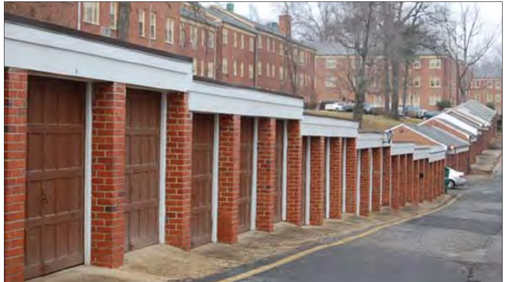
Left: example of appropriate ornament