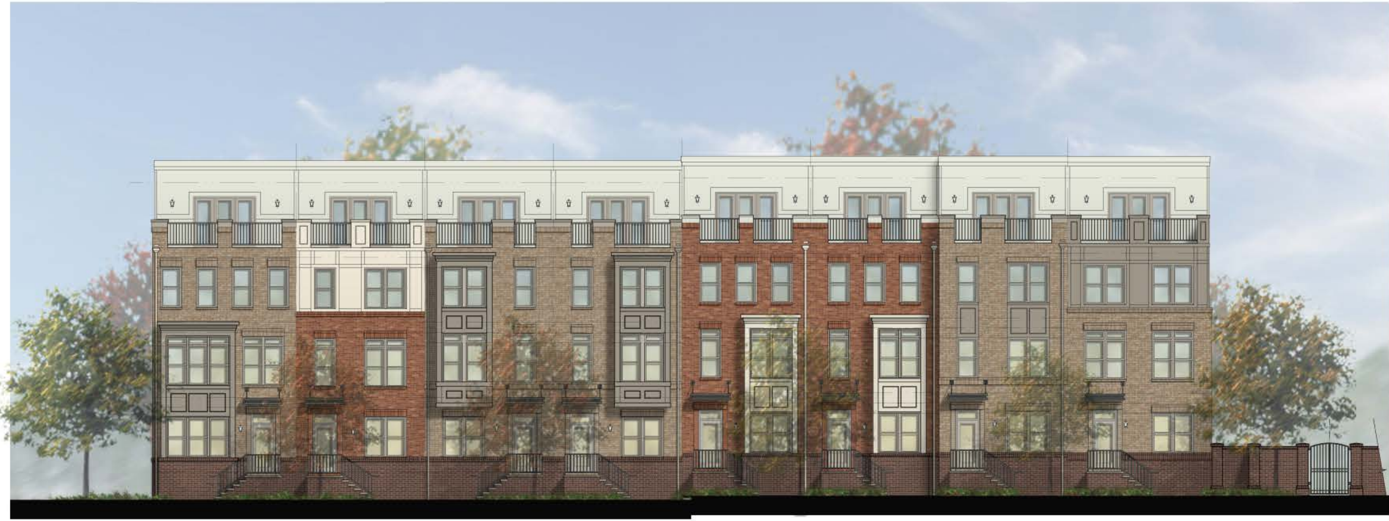
1 A-S220 FRONT ELEVATION - SOUTH GLEBE ROAD NOTE: REQUIRED INFORMATION LOCATED ON SHEET A-S222 SCALE: 1/8" = 1'-0" NVR001A-S220a