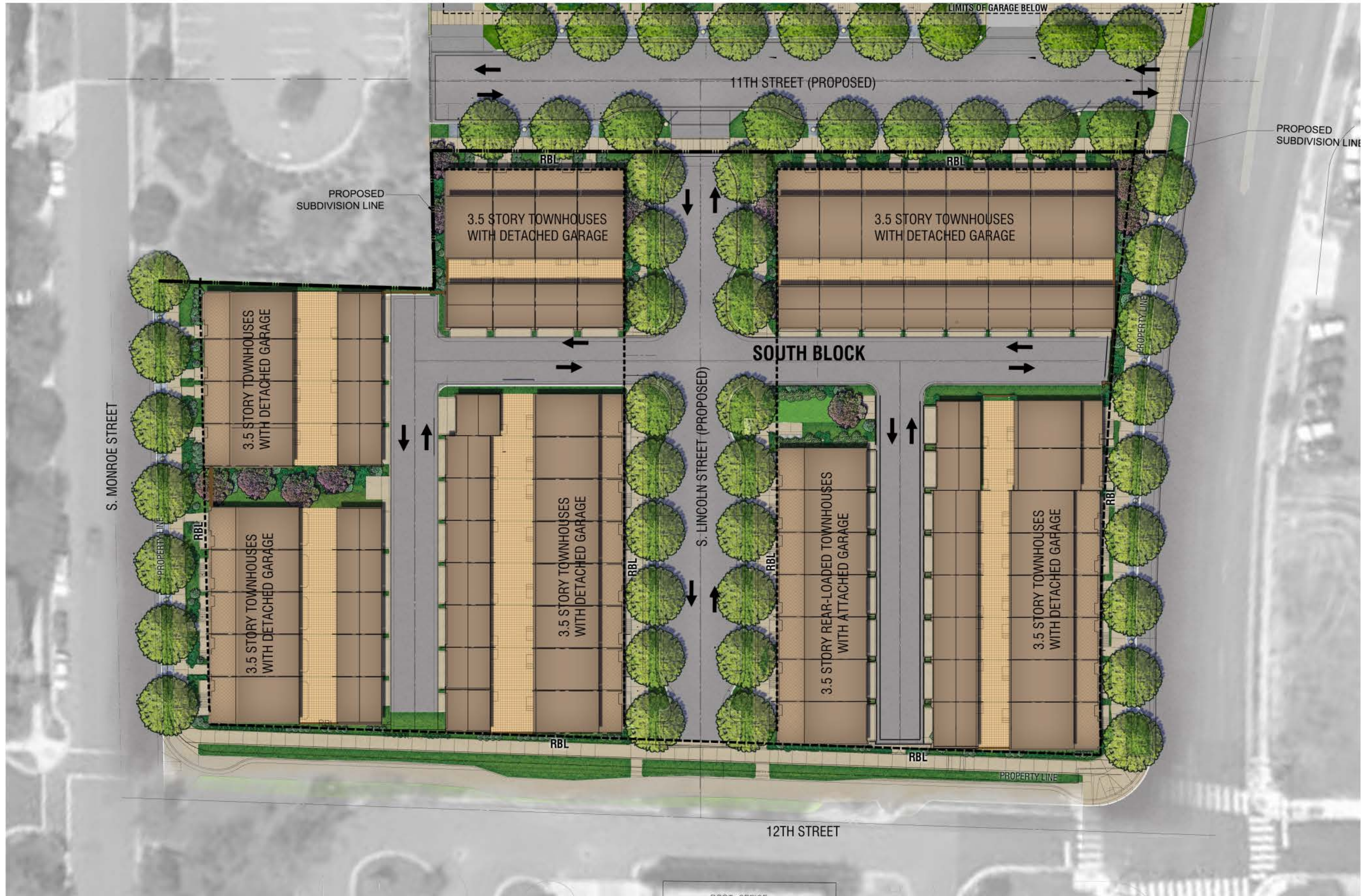
1 A-S101 South Block Site Plan SCALE: 1:20 24x36LDT-Sheet2 (2)