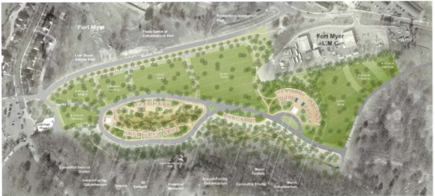
ILLUSTRATIVE SITE PLAN