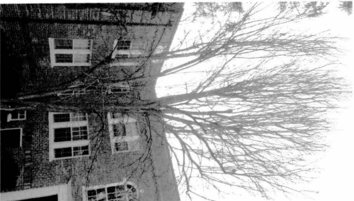
Pear tree on the east side of 1728 Queens Lane