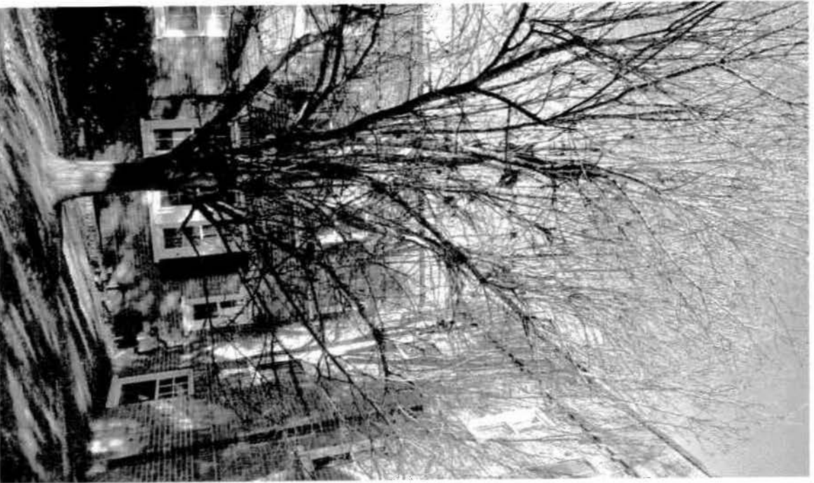
Pear tree on the west side of 1728 Queens Lane